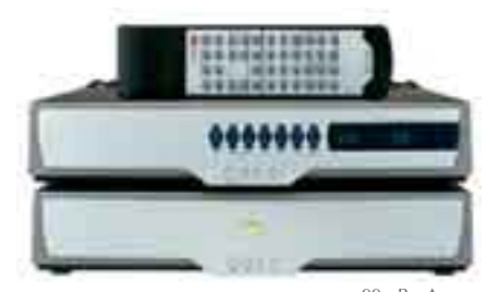
99 - Pre Amp 99 - Power Amp